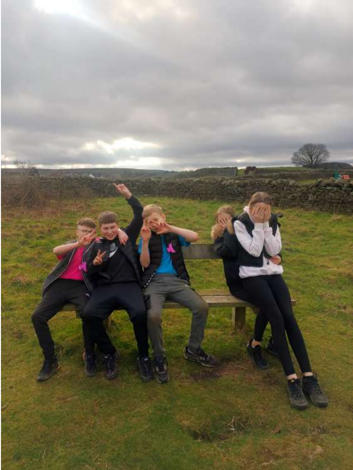
Young People Walks

Detached work is as crucial today as it was back in 1981 with as many young people needing our support as ever. With the continued support of our funders, volunteers and staff we will maintain our high level of service in the area.