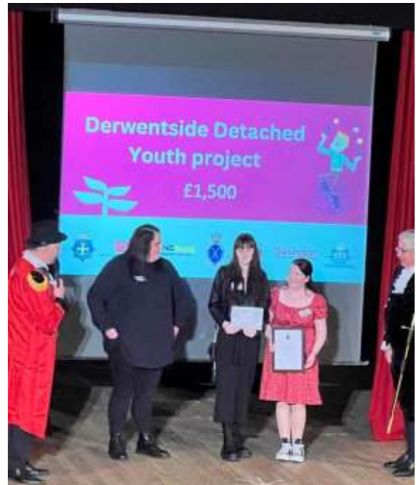
High Sherriff's Awards Night at Ushaw House

Last year we organised a trip to Lightwater Valley for young people involved in our Project. We hired a coach and took approximately 30 to the popular theme park. Aside from the blistering heat young people and staff had a fantastic time.