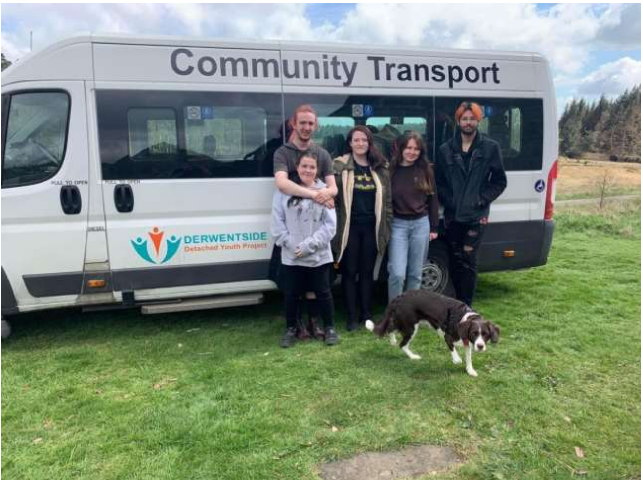
Young people at Charners Farm, 2 day Residential

I am excited to announce that I have been offered a new role as a community worker in Moorside. Thanks to additional funding becoming available, I will be able to put all my efforts into this new position. I am eager to make a positive impact and contribute to the community in this new role.