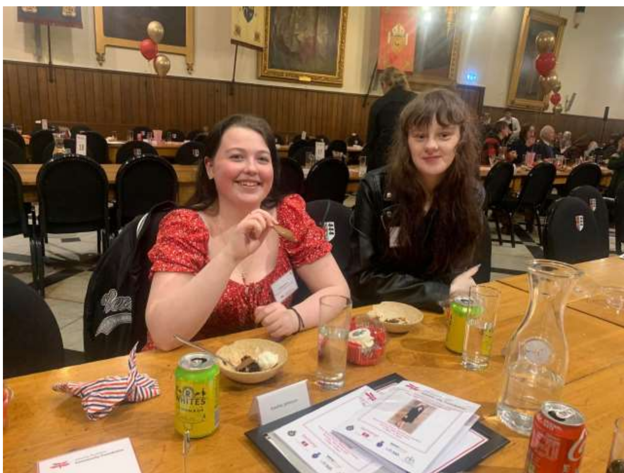
Two of our Young people at the High Sheriff award