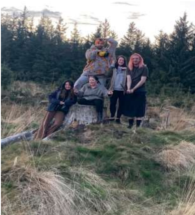
2 Night Residential at Chartners Farm, Harwood Forest, Near Morpeth

In April 2022 we took a small group of young people on a 2 day residential to Chartners Farm a Victorian Farmhouse which is 5 miles into Harwood Forest. Here young people experienced what life was like before technology as there was no TV or internet access. Young people took part in cooking all meals, and lots of nature walks. At the end of the trip all young people commented on how surprised they were that they did not miss TV or their mobile phones as much as they thought they would and that spending quality time together talking with each other and enjoying each other's company had been one of the best parts of the trip. The group has also taken part in bullying and drug and alcohol workshops over the course of the last 12 months. Earlier this year we were invited to attend The High Sherriff's Awards night where we were awarded £1500 in funding. It was a fantastic night and the 2 young people whom attended thoroughly enjoyed the whole experience.