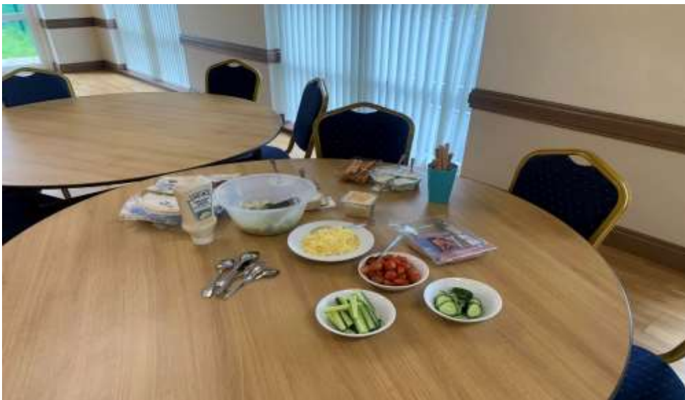
Promoting Healthy Eating

Our Drop In at Burnhope is still being well attended as again the village is quite isolated. Over the last 12 months young people have taken part in various activities and workshops including, Halloween Disco, Christmas trip to Winter Wonderland and workshops including Bullying and Drug and Alcohol Awareness .Young people have also taken part in lots of arts and craft sessions. We also work detached in the area on the same night as the Drop In, to try and encourage other young people in the area to attend.