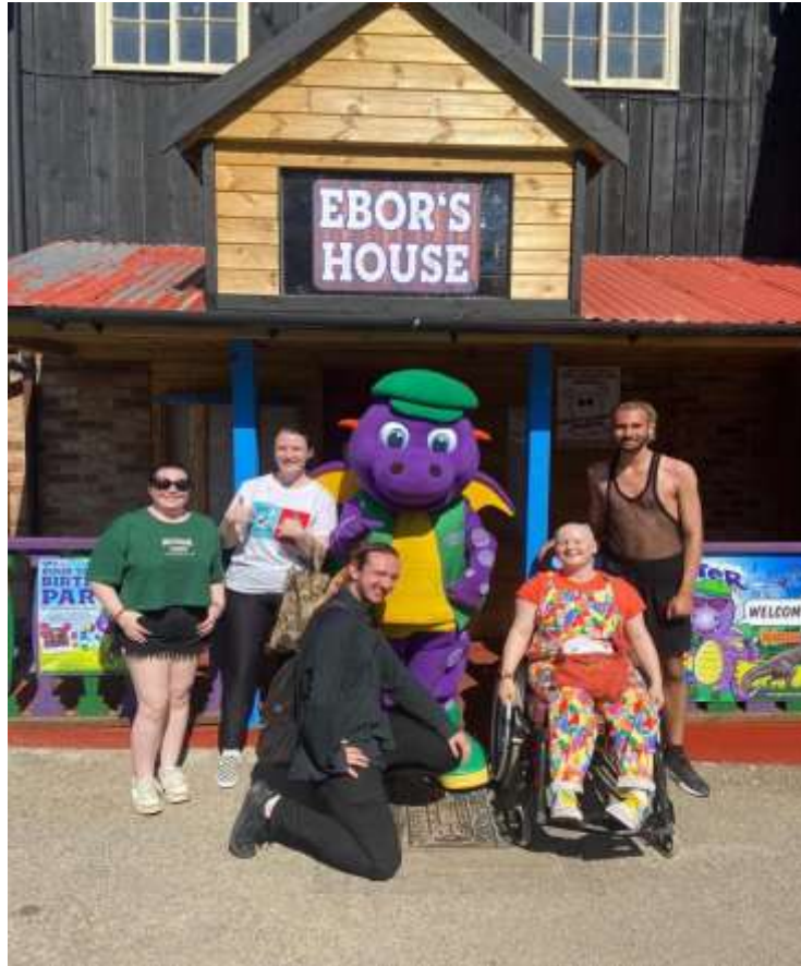
Lightwater Valley Trip

Detached work is always challenging. One of the main reasons being social media and online gaming. Young people spend more time online which makes it difficult to engage with them in person as they are often at home in their rooms. This is why it is important to try to engage with them in "real life" where we can offer them support and guidance as I believe that detached youth work can play a vital role in building stronger, more resilient communities in the future.