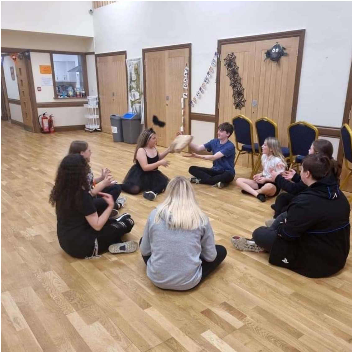
Some of the YP at Burnhope Youth Drop in Halloween Party

Burnhope Youth Drop In on Friday nights has been especially successful, with numbers growing every week. Although there was a sudden drop in attendance due to Covid, we are glad to see that it has slowly built back up over the weeks and has become one of our most popular nights.